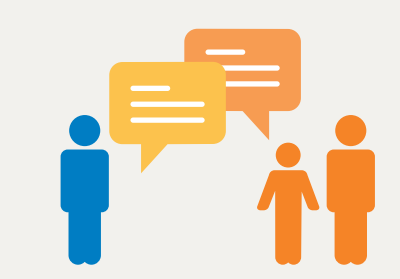
Figure 4. Getting ready to talk about weight